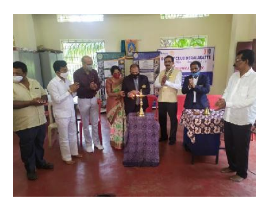
Inaguaration of Medical Camp