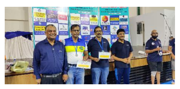
Zonal Indoor Sports Meet